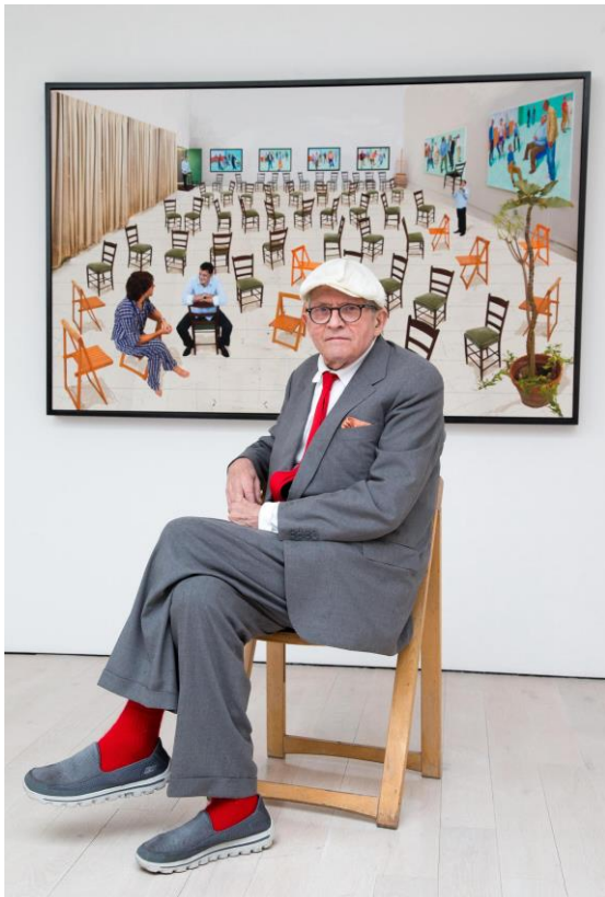
David Hockney at Annelly Juda Fine Art in 2015 on the occasion of his solo exhibition there, Painting and Photography.