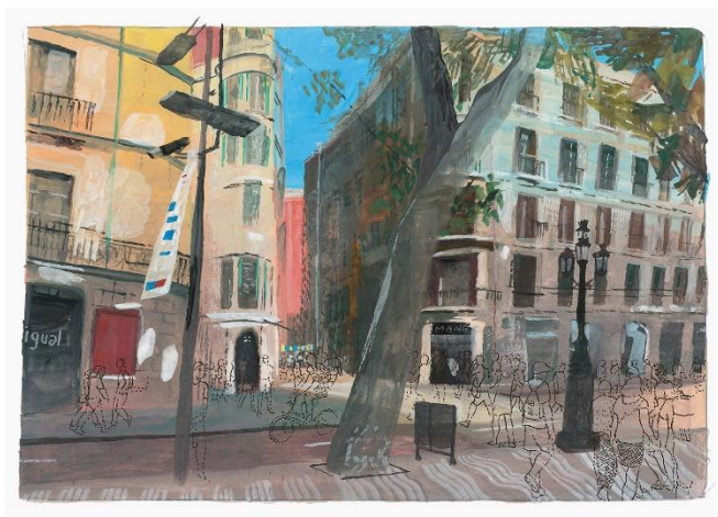
Marc Desgrandchamps, Barcelona, Barri Gòtic , 2018 Ink and gouache on paper, 20 x 29 cm

Marc Desgrandchamps, born in 1960, studied at the Fine Arts Academy of Paris. In the 90s he breaks free from the opposition between figurative and abstract art characteristic of the great majority of XXth century pictorial narratives.