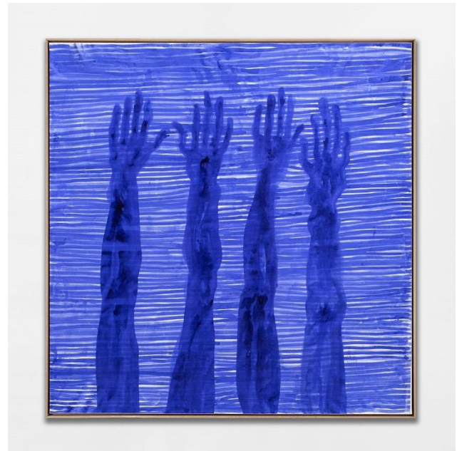
Partage VII , 2020, ink on canvas, 200 x 200 cm.

“This year marks the 30 th anniversary of the death of Edmond Jabès, the poet and writer of African (Egypt) origins. His work has never ceased to enlighten us. With his questions and formulations, Edmond Jabès is in harmony with my vision of the world, and his work resonates with my artistic practices. A complicity of thought emerged when reading his writings. Learning more about the world of Edmond Jabès, particularly his “ Livre du partage ” (the Book of Shares) inspired me to conceive an artistic proposal during the Busan 2020 International Biennale in Korea; this resulted in a series of 8 paintings entitled Partages I – VIII . My personal exhibition at Galerie Lelong & Co. in September 2021 will continue the work started in Busan in 2020. This project, which consists of a series of blue paintings produced in 2020 and 2021, will include a brand-new interactive installation: the public will be invited to make a material donation or send a paper or electronic message.” - Barthélémy Togu