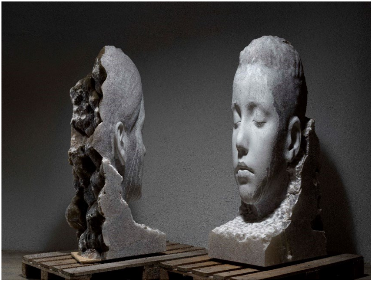
© Jaume Plensa.