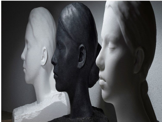
© Jaume Plensa.

13 rue de Téhéran 38 avenue Matignon 75008 Paris